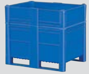
Special height SH - 1000