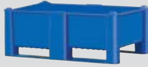
Special height SH - 440