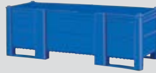
Special length SL- 2160