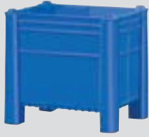
Special length 600 X 800